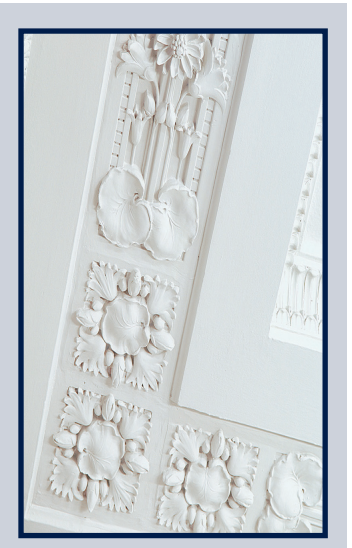
The frieze from above the vault.

On the ceiling above the vault, a decorative