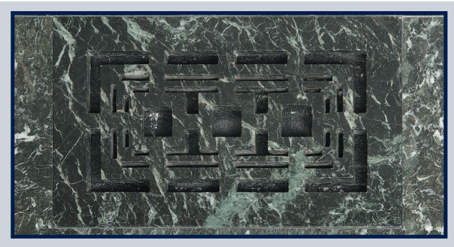
Green marble ventilation grid.

The white marble is called English Vein Italian white marble and was imported from the Carrara District of Italy.