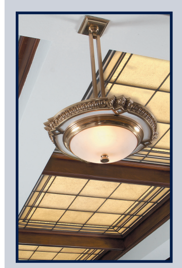
Skylights and light fixtures in a third floor meeting room.

The third floor light fixtures show an art deco influence. Remarkably, most of the original fixtures are still in place today after more than 90 years of continuous use.