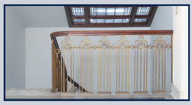
Decorative staircase metal work.

The vault cove may have been inspired by the decorative cove on the center ceiling of the building. The ceiling cove has a unique pattern that incorporates the lion motif and lotus pattern.