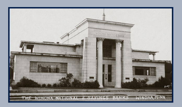
The completed building in 1916.

You will find many interesting artistic and architectural features on the tour. We hope you enjoy your visit!