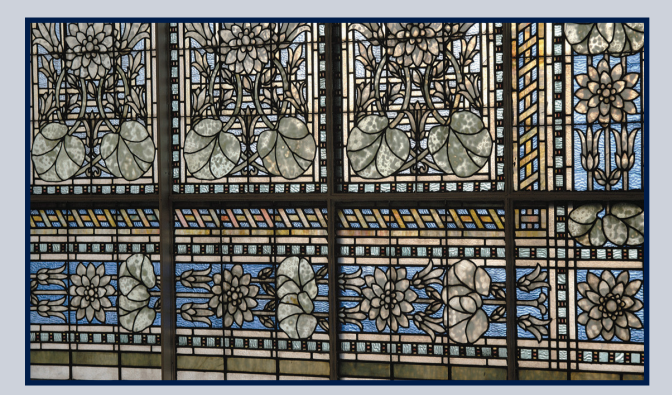
Original Tiffany stained glass.

The famous Tiffany Studios of New York created all of the building's stained glass windows from architect George Maher's sketches. The art glass was so dazzling that the local newspaper considered its installation newsworthy.