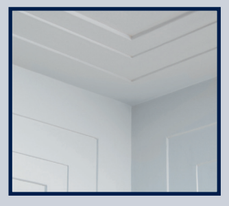
Decorative cove (above) and Prairie style molding.

Prairie School influences. These original furniture pieces were carefully restored in 1991 during the building's last major renovation.