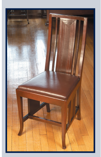
Prairie School-inspired furniture.

Financial's Downtown building. If you would like to arrange a group tour, please call at least one day in advance (507-454-8800 or 1-800-546-4392 if calling from outside the Winona area). WNB Financial gratefully acknowledges the Winona County Historical Society for the use of its resources in the publication of this book.